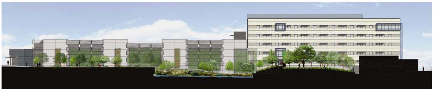
West Building Elevation