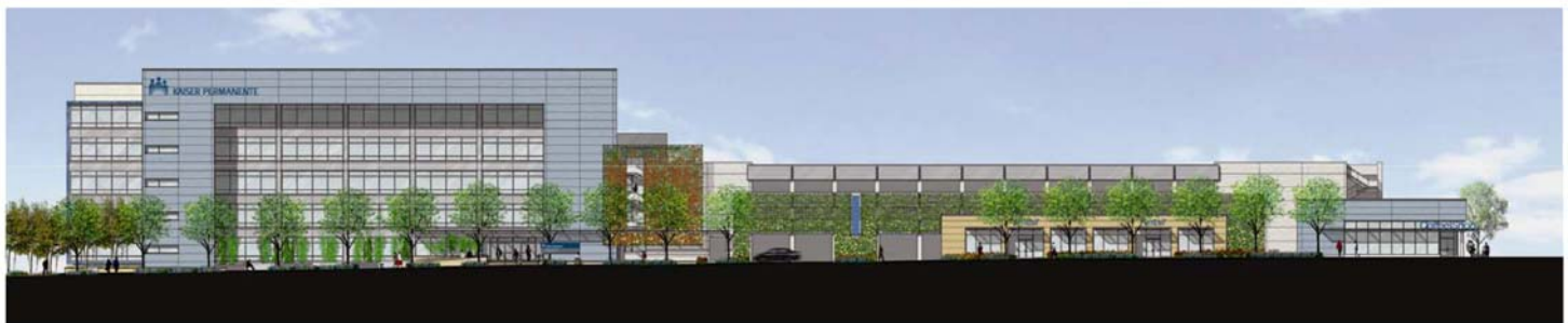
East Building Elevation

Donations welcome PANIL is one of the neighborhood groups in the coalition. KENIC welcomes donations to cover legal, printing, and other expenses. To donate, make a check payable to PANIL with KENIC in the memo line. Mail to PANIL, P. O Box 20375, Oakland, CA 94620.