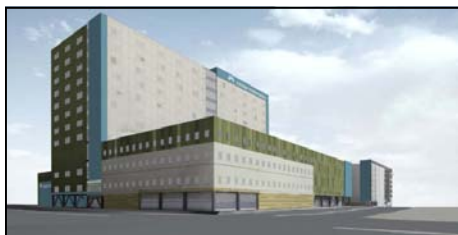
Architects' rendering of the Kaiser hospital replacement with landscaping and background structures removed. Broadway is to the right, MacArthur to the left.

enter the hospital from Broadway to a dock completely hidden underground. The project will occupy the entire block from MacArthur to the 580 overpass, between Broadway and Piedmont Ave. with the hospital tower, clinics and services such as MRI, administration space, garage, and a plaza for a farmers' market and other activities.