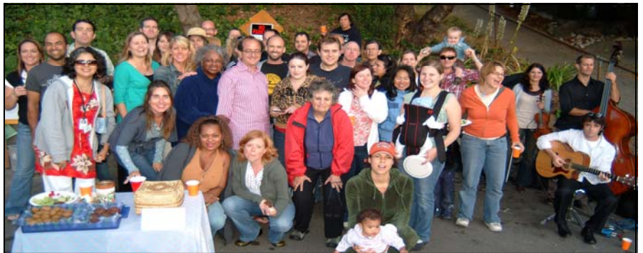
The Rio Vista gathering in 2007

To register, go to www.oaklandnet.com/nno2008.html