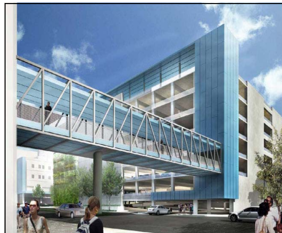
A pedestrian sky bridge connects the Mosswood office building with the new garage. The 580 overpass is just out of view to the right. This design proposes a very utilitarian cement column in the middle of Broadway.

The landscape designers were praised for their efforts to enhance the streetscape and buildings and to minimize water runoff with landscaping. Plans show two inner courtyards that punctuate the podium base of the tower. And there is discussion underway of a rooftop garden on the low-rise section which could be a much more pleasant sight for hillside neighbors whose houses look down on it than the usual tar and gravel with condenser units.